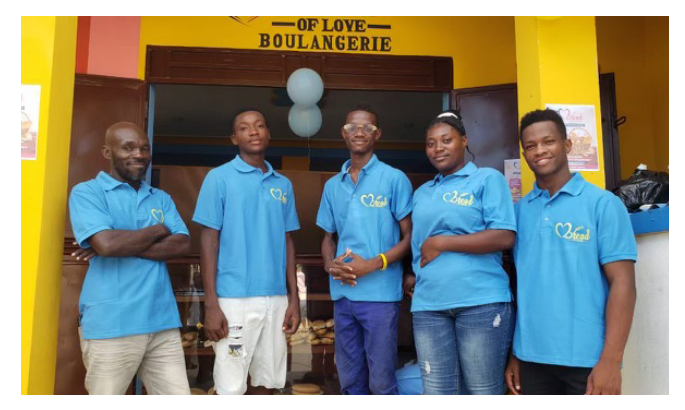
LOVE TAKES FLIGHT CANDIDATES WORKING IN THE BAKERY. ONE OF THE CANDIDATES MADE THE SHIRTS WITH HER GRAPHIC TEE BUSINESS!